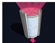
Figure 1. Process sketch of the insect exchange column used for the project. Ref: http://www.generon.co.uk/acatalog/Chromatography.html

The bulk solution prepared to create the standard curve was used in the second day of testing to obtain the exchange capacity of the insectac 249 resin. The solution was pumped through a bathroom scale into the prototype insect exchange column. 45 mL of resin was rinsed and added to the column. The bed was fluidized as the solution was pumped through the resin, but for the creation of the \text{Ca}^{2+} concentration vs. time curve, the solution was pumped down through the column, as illustrated in the process flow diagram seen in Figure 1.